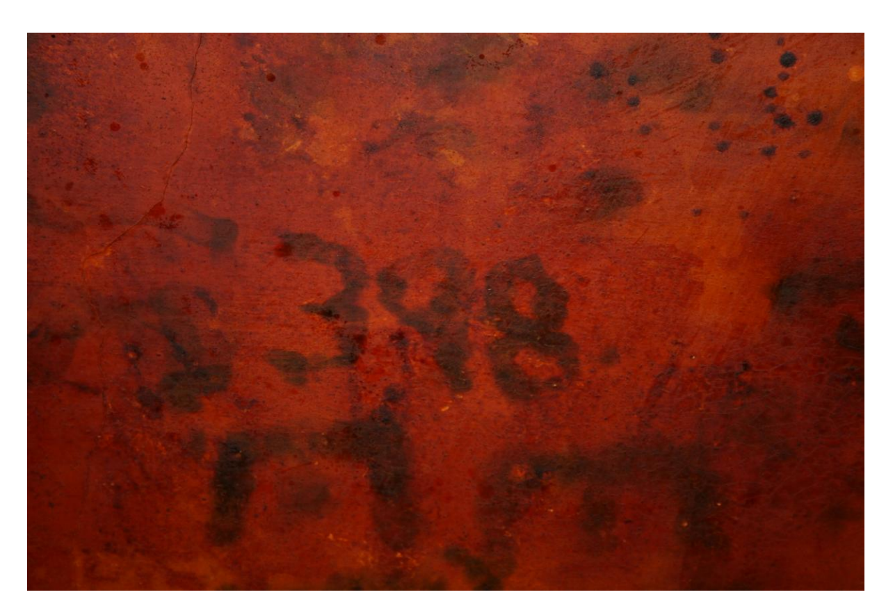
There it is -398 on this famous ceiling